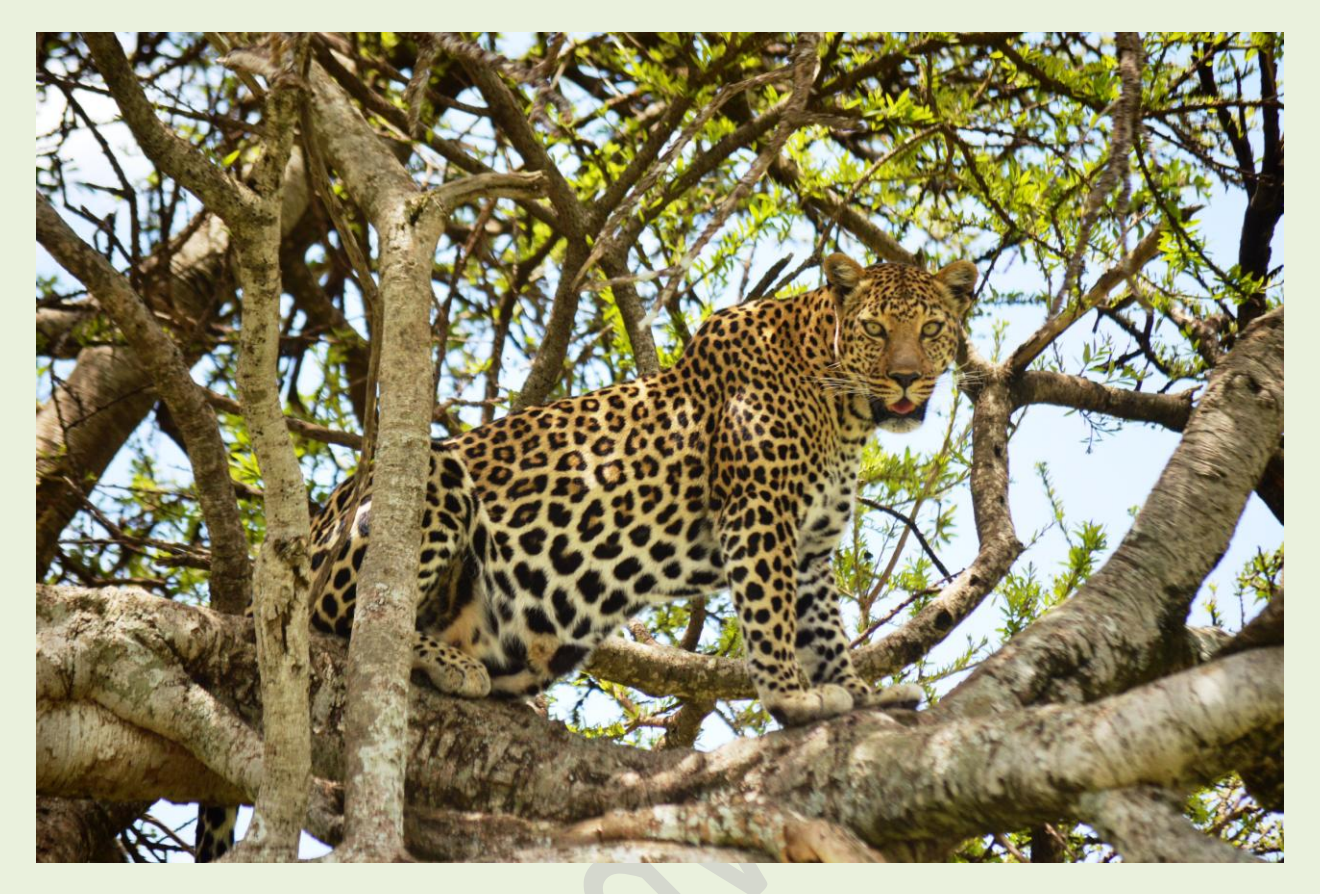
DAY 5: MASAI MARA - NAIROBI

You spend this last morning in the Masai Mara admiring the unspoiled Africa as you prepare for a drive back to the buzzing Kenya's capital bringing to an end what we hope shall be a safari of your lifetime. Lunch shall be en route Nairobi at Narok town. We hope to welcome you back to magical Kenya! And as we say here, "Karibu Tena".