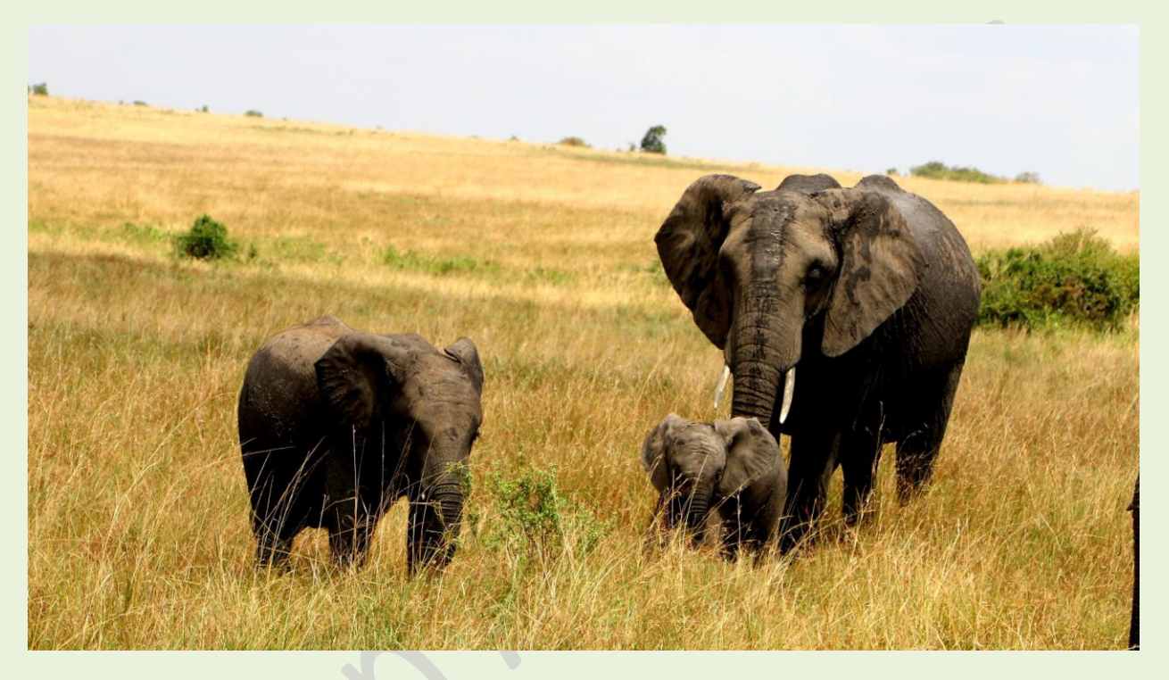
DAY 3: LAKE NAKURU - MASAI MARA GAME RESERVE

Rise up early for breakfast, check out and depart Lake Nakuru National Park for Masai Mara Game Reserve. We will arrive at the camp with enough time to settle in before lunch with a little time to relax before we head out for our evening game drive between 1600hrs to 1830hrs. Masai Mara is one of the lushest reserves in Africa and is globally renowned for the Great Migration when thousands of wildebeest, zebra, and Thomson's gazelle travel to and from the Serengeti, from July through October. In the Mara River, throngs of hippos and crocodiles lurk.